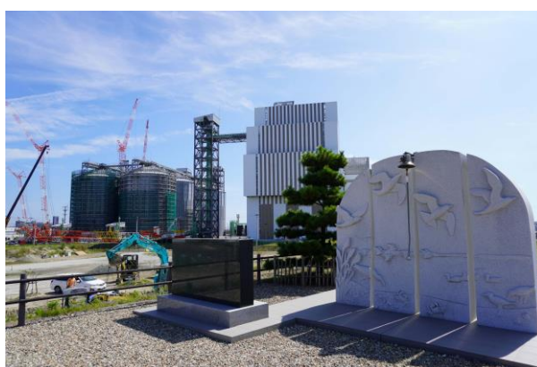
Nakano Densho-no Oka and the Sendai Gamo Biomass Power Plant

The power plant is located in an area where around 80% of the approximately 1,500 houses were either washed away or completely destroyed by the 2011 Great East Japan Earthquake and tsunami. Many people lost their