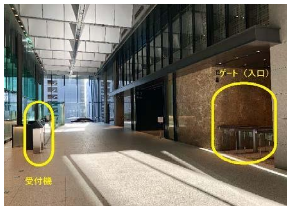
The visitor reception machine is located in the center of the office entrance.