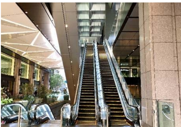
Take the escalator located at the center of the building to the third floor.