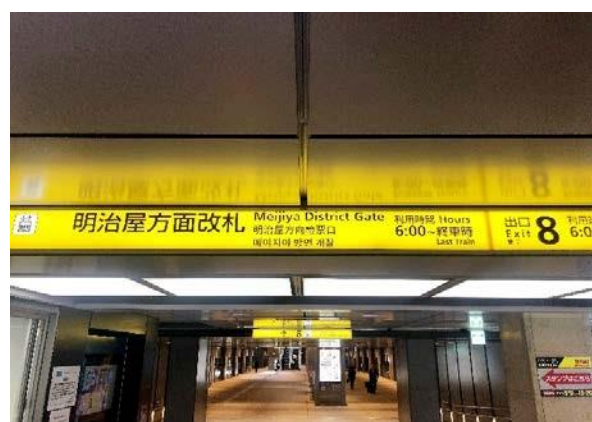
Walk through the Meijiya District Gate and head toward Exit 8.

From Kyobashi Sta. on Tokyo Metro Ginza Line