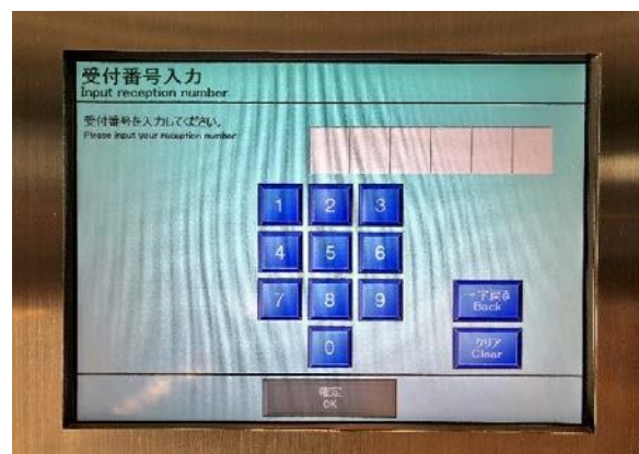
Enter the six-digit code issued at the time of making an appointment using the touchscreen panel.