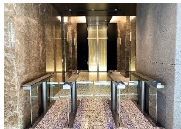
The gate to the 13th to 18th floors is found on the side opposite to the machine. Allow the QR code (2D code) to be scanned by the reader on the gate and then proceed to the 18th floor.