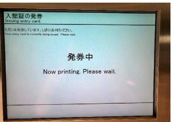
Press the "Issue Card" button, and a card will be dispensed from the lower part of the machine.