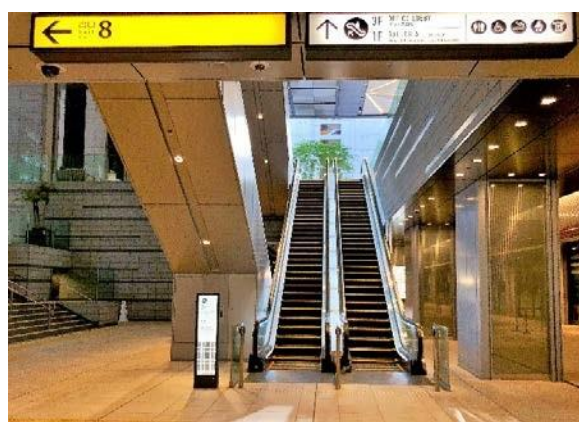
The gate is on the first basement floor. Take the escalator to the ground level.