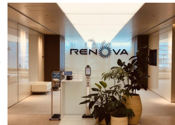
Use the tablet at the reception and call the person in charge.